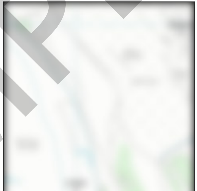
Approximate position of property