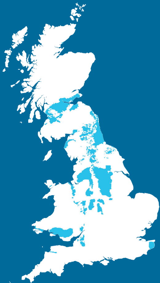
■ Britain's coalfield